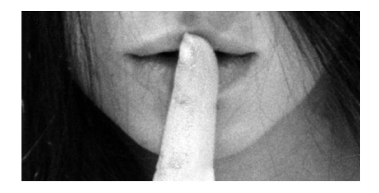
Shhhh... So far, so good...